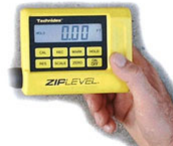
Figure 2 – Stanley CompuLevel

6275 W PLANO PARKWAY, SUITE 140 • PLANO, TX 75093